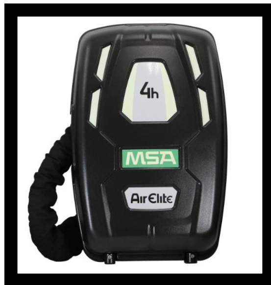
Figure 1 – MSA AirElite 4h Closed Circuit Breathing Apparatus

AirElite 4h units must be stored at temperatures above +10°C (50°F) if they contain canisters manufactured from October 2020 (05/2020) through July 2023 (07/2023). If you have been storing your AirElite 4h units at temperatures below +10°C, please relocate them to a new location above +10°C prior to usage. Manufacturing date of the canister can be found on the canister itself, or on the original shipping package, shown in Figure 2.