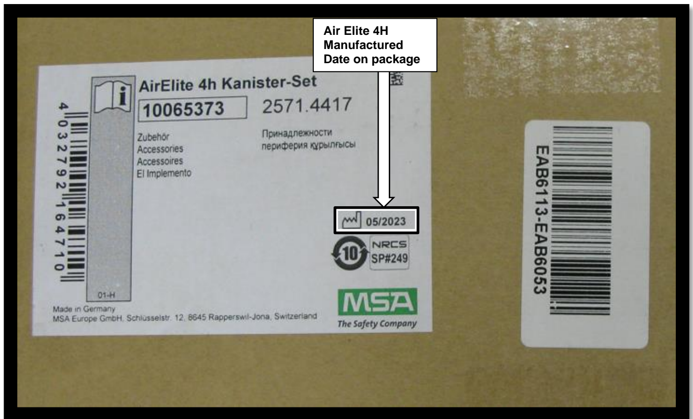
Figure 2 – Canister Manufacturing Date